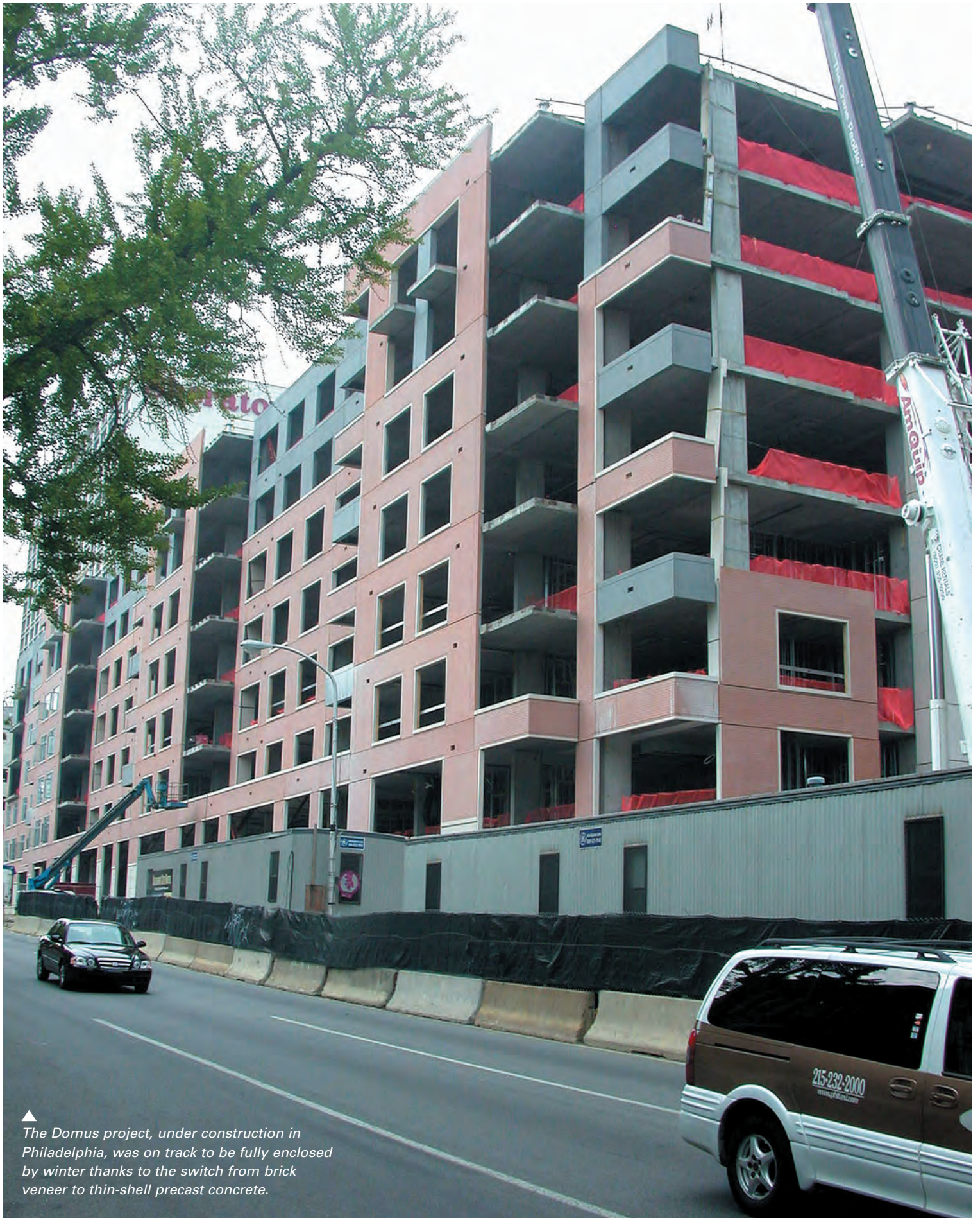
▲ The Domus project, under construction in Philadelphia, was on track to be fully enclosed by winter thanks to the switch from brick veneer to thin-shell precast concrete.